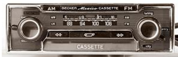
Mexico Cassette AM/FM Stereo 2- piece - early model All Mercedes