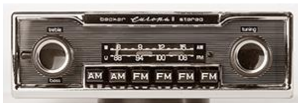
Europa II 6 button AM/FM Stereo All Mercedes