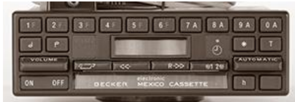
612 AM/FM Stereo - late model All Mercedes