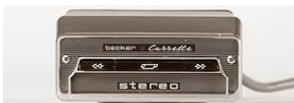
Becker Cassette All Mercedes