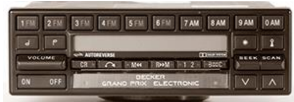
780 AM/FM Stereo All Mercedes