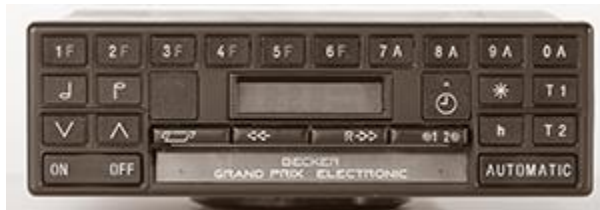
612 AM/FM Stereo - early model All Mercedes