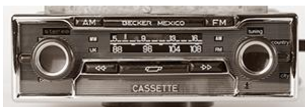
Mexico Cassette AM/FM Stereo 2- piece - late model All Mercedes