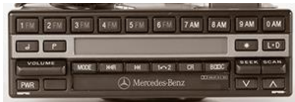
1432 AM/FM Stereo 2- piece All except 190E