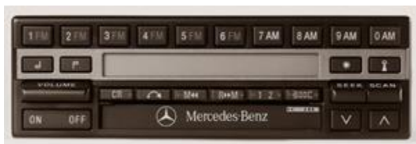
1480 AM/FM Stereo All Mercedes