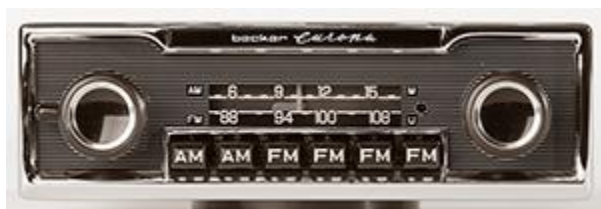
Europa 6 button AM/FM Mono All Mercedes