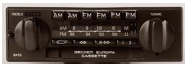
Europa Cassette AM/FM Stereo All Mercedes