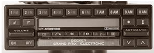
754 AM/FM Stereo All Mercedes